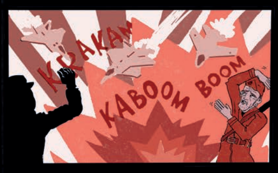
And so, on with the flames / upon villages and huts, here's gas, bomb, bacterias / from the bellies of the planes.