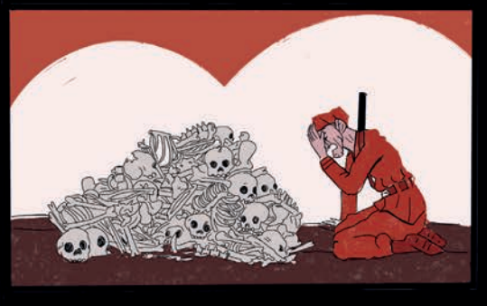
Little soldier, isn't this/ illegal immigration? Criminal and murderous,/ the good Italian soul?