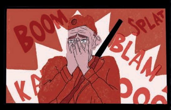
With phosgene and mustard gas / we cut down many lives, who remains goes to the fields / with the others, to die.