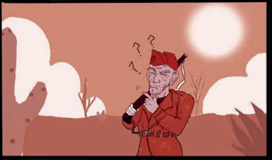
«What a strange word: / not English, but Italian?» the little soldier asks himself / in his little black coat.