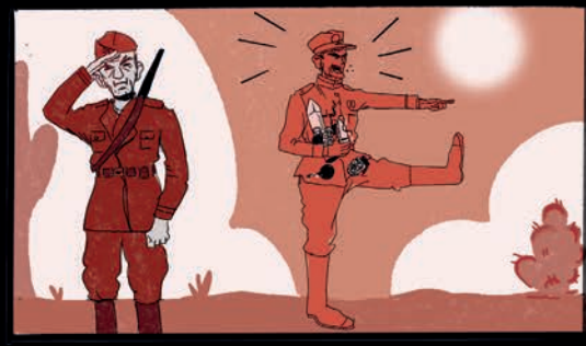
«Forget the questions, / there's still a lot to do!» answers the General, / taking up an arsenal.