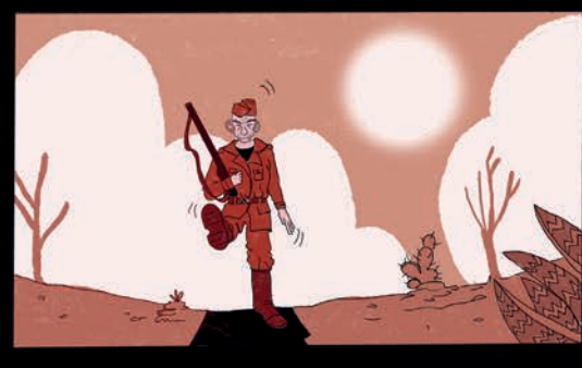
There in Eastern Africa / A land he doesn't come from, goes the fascist soldier / to "import colonialism".